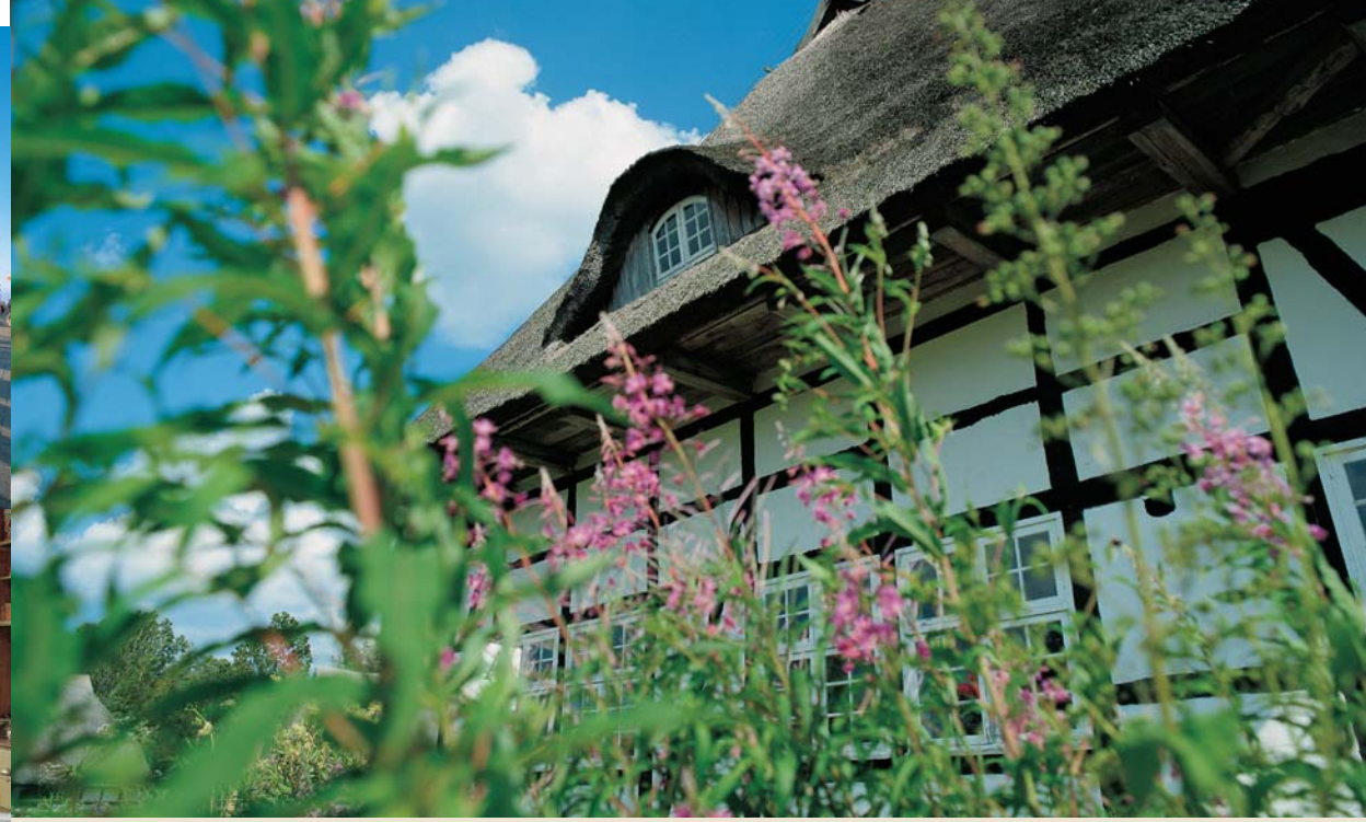
Many houses in the region are still roofed with reeds, a tradition that has lasted for generations.