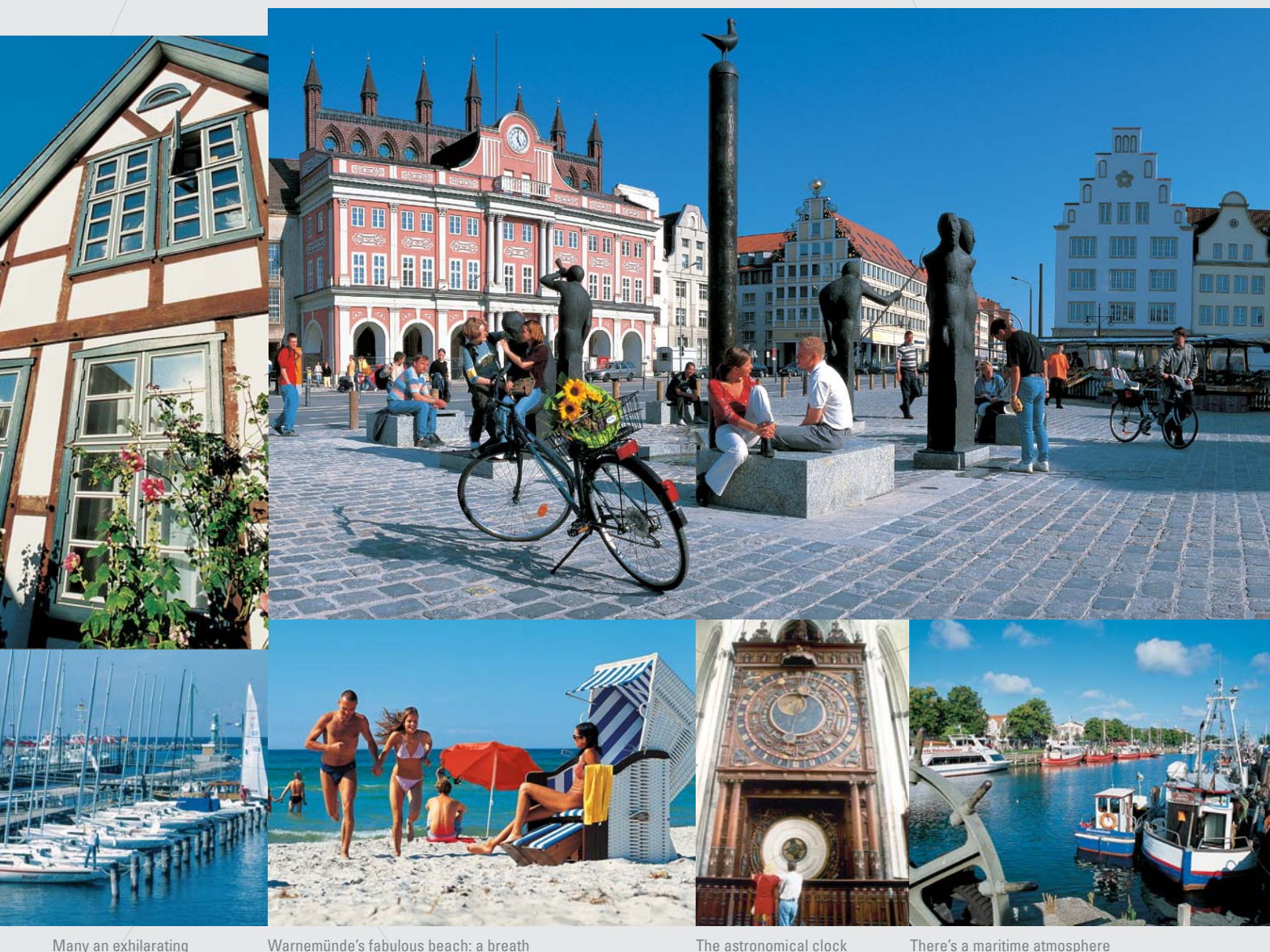
Many an exhilarating sailing trip starts out in Warnemünde's yacht harbor.

It's worth going ashore Already on the quay you'll experience Germany's proud and beautiful North