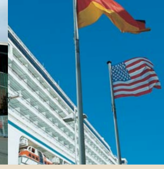
Visitors receive a warm welcome from local residents.

Previous stop-over calls >> Carnival Corporation (Holland America Line, Cunard Line, P&O, Princess Cruises) with the Noordam, Oosterdam, Rotterdam, Westerdam, Prinsendam, Amsterdam, Caronia, Queen Elizabeth II, Aurora, Arcadia, Oriana, Grand Princess and Star Princess >> Royal Caribbean Cruises Ltd. and Celebrity Cruises with the Jewel of the Seas, Constellation and Millennium ▶ Radisson Seven Seas with the Seven Seas Voyager and Song of Flower ▶► Crystal Cruises with the Crystal Symphony ▶► Norwegian Cruise Line with the Norwegian Dream and Norwegian Jewel ▶► Seabourn Cruise Line with the Seabourn Pride ▶► Oceania Cruises with the Regatta and Insignia >> Fred Olsen Cruise Line with the Black Watch and Braemar >> Hapag Lloyd with the Europa ▶► MSC with the Rapsody to name but a few