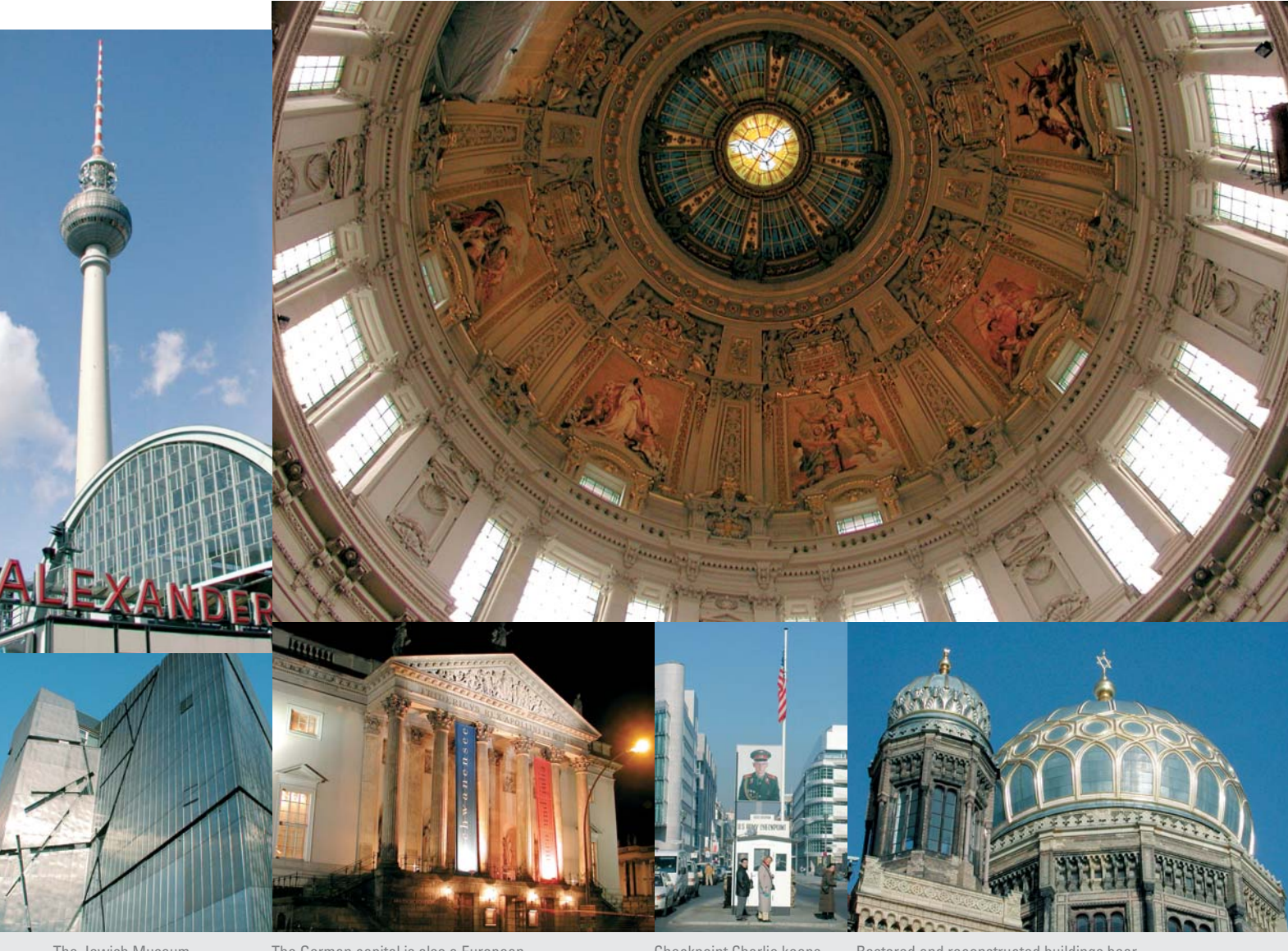
The Jewish Museum is one of Berlin's most popular new cultural attractions.

Enlightening and electrifying: A side trip to the German capital