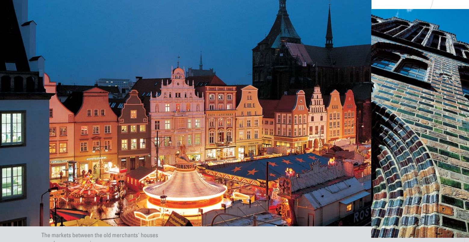
are always an experience.