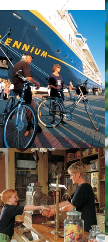
Local residents maintain their traditions with much dedication and energy.

In the footsteps of the emigrants Old villages and powerful Hanseatic towns, graceful landscapes and images full of yearning